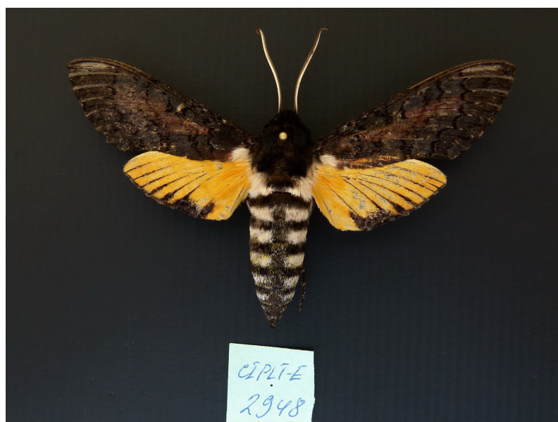
Figure 7. Isognathus caricae (CZPLT 2948).