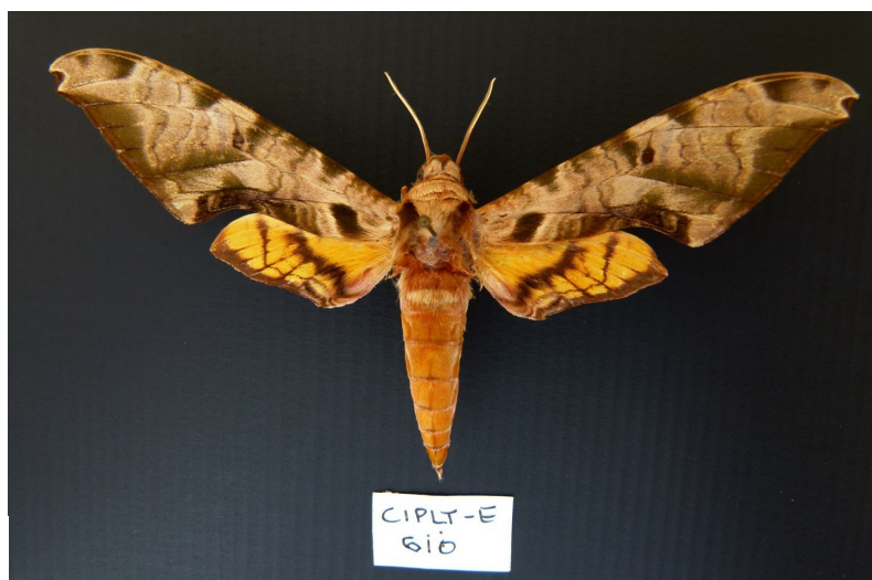
Figure 2. Protambulyx eurycles (CZPLT 610).

another that has been generally omitted from Paraguayan lists: Callionima guiarti (Figure 5). The specimen number is given in italics followed by collection date in parentheses.