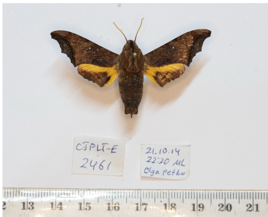
Figure 6. Nycteryx stuarti (CZPLT 2461).