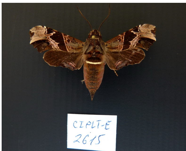
Figure 4. Unzela japix (CZPLT 2615).