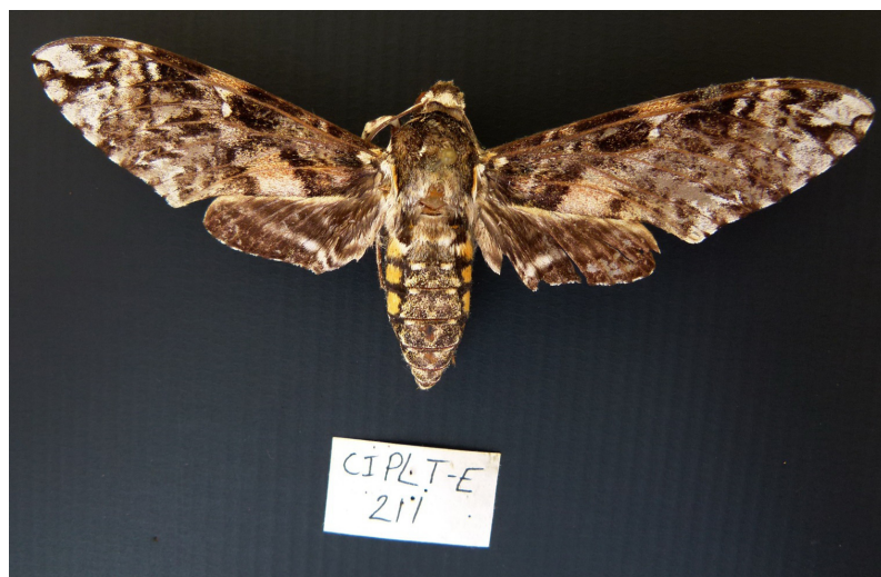
Figure 3. Manduca leucospila (CZPLT 211).