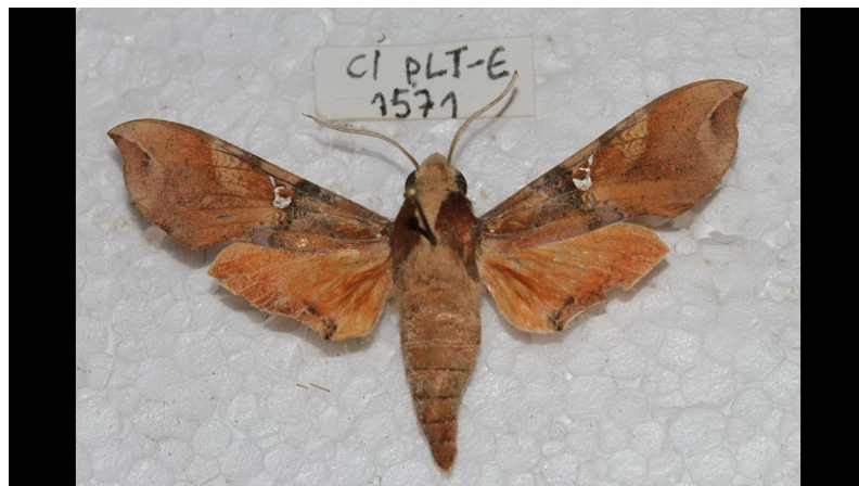
Figure 5. Callionima guiarti (CZPLT 1571).